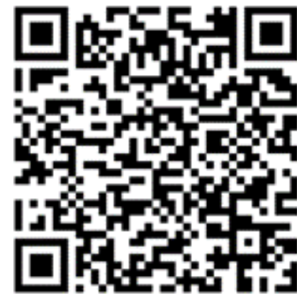
How do I connect to WiFi on campus?

Note: Mac users must provide an adapter to connect to the HDMI cable.