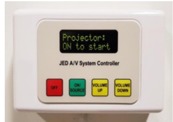
Wall-mounted AV controller

The AV control panel will indicate Laptop HDMI as the default input and show a countdown warmup timer for the projector