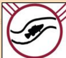
The Fifth Way (Land Links) Symbol of the river

While each symbol represents a single way of learning, the whole picture is modelled on a kinship system to show the dynamic and interactive nature of these complex processes. In each issue of Connecting the Dots , two of the 8 ways of learning will be featured as a guide to assist teaching academics.