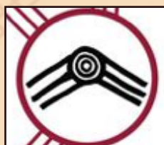
The Sixth Way (Non-linear processes) Symbol of circular logic and interface between opposites

In a teaching context this can mean applying place-based learning, linking content to local land and place, and using physical elements to provide important metaphors for difficult concepts.