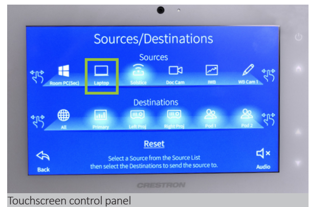
Touchscreen control panel