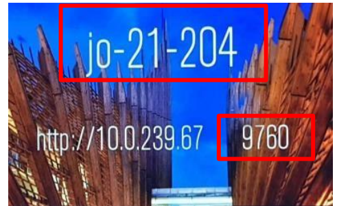
Example Solstice room and key code

Input the 4-digit key code from the destination monitor. You will now see the content that is on your own device displayed on the monitor.