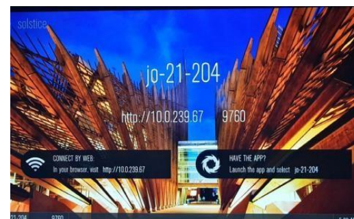
Solstice on the projected screen