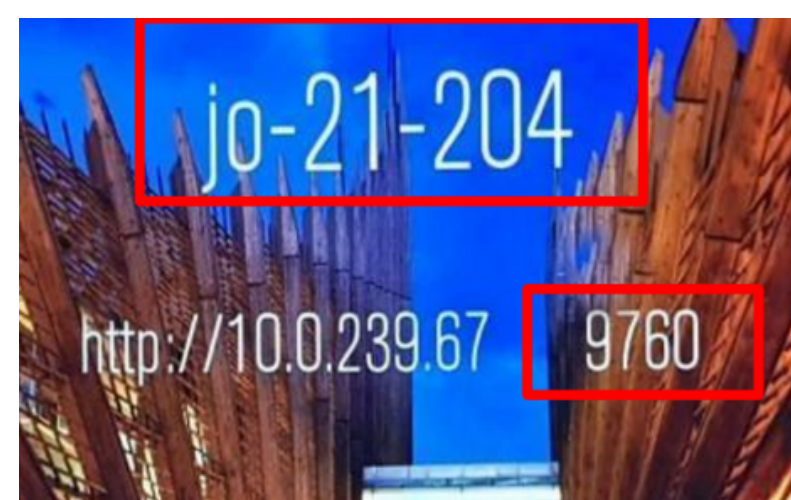
Example Solstice room and key code

Input the 4-digit key code from the destination monitor. You will now see the content that is on your own device displayed on the monitor.