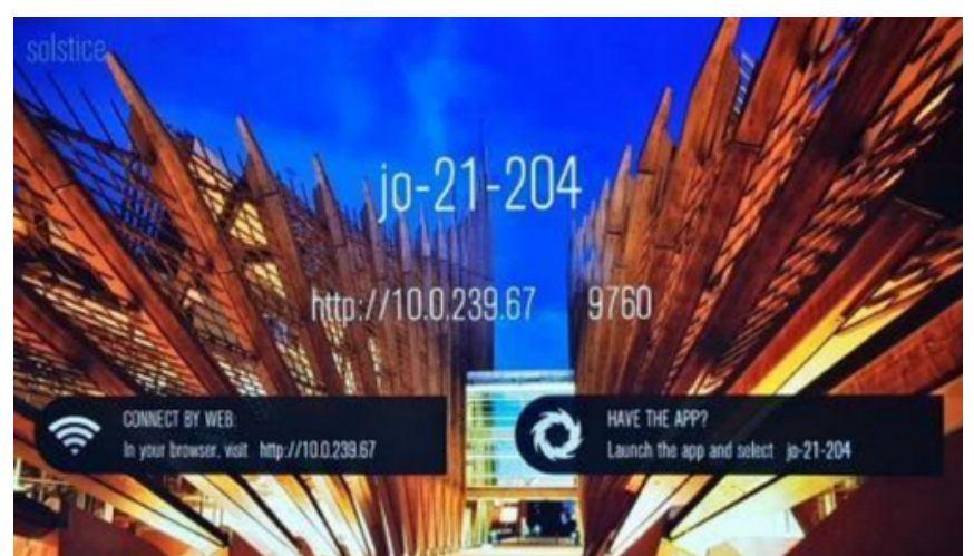
Solstice on the projected screen