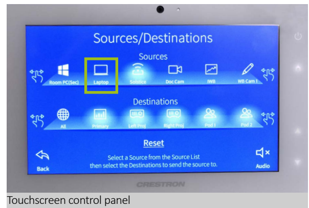
Touchscreen control panel